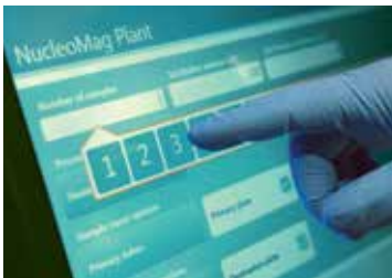
Nucleic acid purification wizard

The TouchTools displays exactly what the operator needs for a run. User prompts with graphics provide step-by-step setup instructions for worktable set up, clearly and concisely.