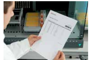
Sample tracking report