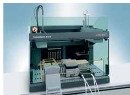
Nucleic acid purification workstation